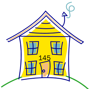
House appropriately marked