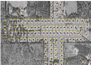
View of an area with addresses assigned

In order to provide the location of the caller, the telephone number must be linked to a physical address. The creation of this address is accomplished in the 911 Addressing Center for property located in unincorporated areas of the County . Port Royal, the City of Beaufort, the Town of Bluffton, and Hilton Head handle their own addressing and supply this information to the 911 Addressing Center so it can be incorporated into the database.